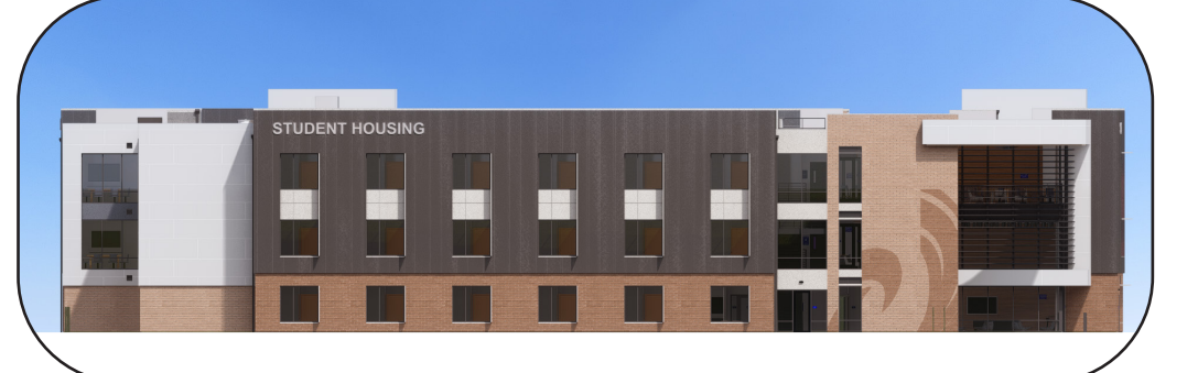
RENDERING WEST ELEVATION